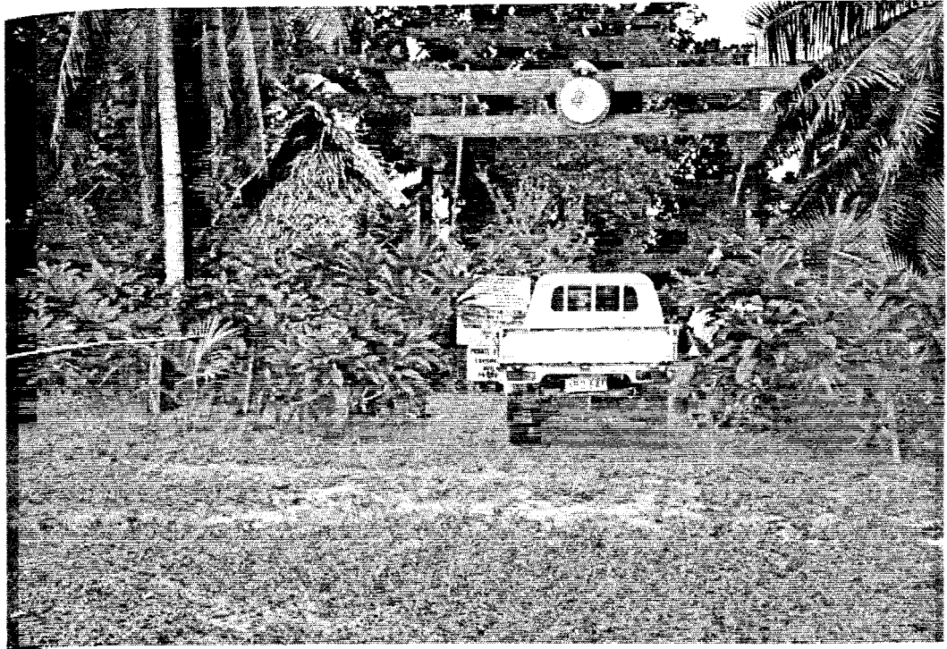
FIGURE 2. Entrance to the Mölmahao Cultural Centre and Museum.

ing of the - "LOGO" requires (a) LOVE. (b) SINCERITY. (c) PATIENCE. (d) COURAGE.