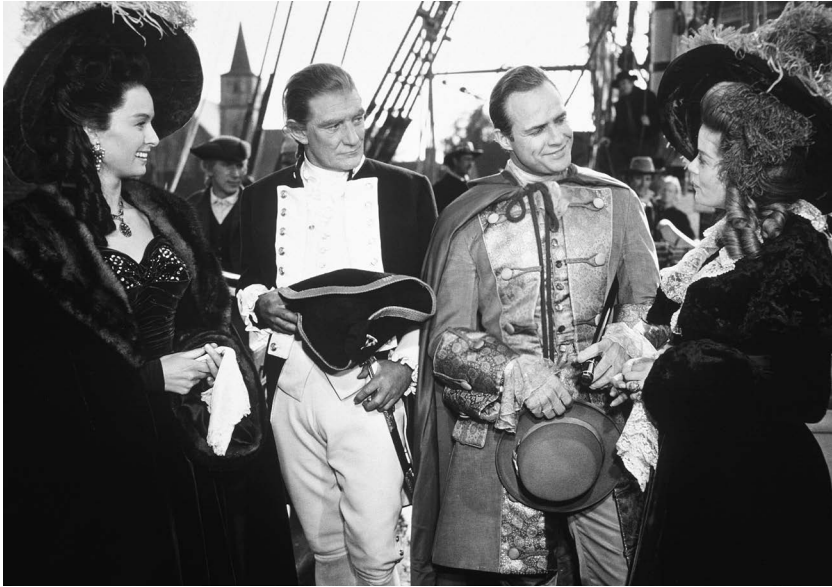
FIGURE 1. Captain Bligh is introduced to Fletcher Christian's upper class friends.

that “one had to do something.” Bligh answers that “high born connections” were not a substitute for “hard work” and goes on to explain, in response to Christian’s cynical view of their mission, the importance the Royal Navy accords it. Christian, for his part, acknowledges that “promotions” might then be in order. In other words, Bligh is depicted as a middle-class, career seaman and officer, rather than a gentleman of quality. He is a leader, but one who is a man-in-society, that is to say, in the same stratification system, with the same ambitions, as everyman, rather than above them.