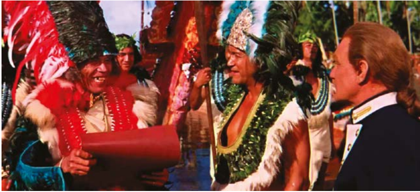
FIGURE 3. Captain Bligh asks “King” Hitihiti, left with headdress, for breadfruit seedlings.

final voyages, having served as his island pilot, and that he will now serve as Hitihiti’s translator. “Hitihiti talk, I talk English.” Having himself sailed on Cook’s last voyage, Bligh recalls and compliments the great, good work Minali’i did for Cook and then orders his sailors to bring a trunk of gifts, which they deposit in front of Hitihiti.