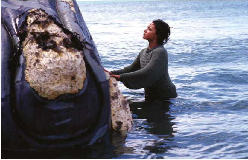
FIGURE 8. Paikea rides the whale.

and looks at her grandfather who raises his head and looks back at her in shame, perhaps, and love. Now the music has become ominous.