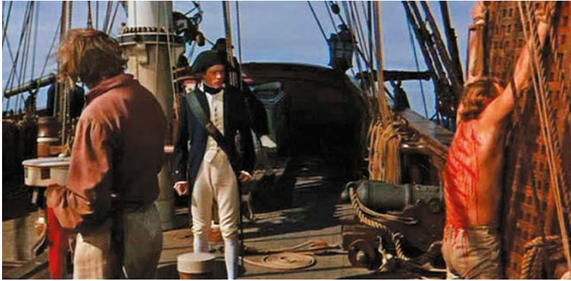
FIGURE 2. A seaman is flogged for stealing cheese.

recalled to them. Bligh immediately orders Ned Young to spend the night high up a mast despite the freezing temperatures they have encountered. Before waddling off to his quarters, he answers Christian's protestations, declaring that he "will not be a figure of fun!" which is to say that he would not tolerate any challenge from an officer, comic or otherwise, to his superior status on deck.